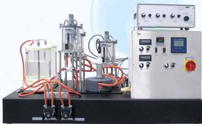
Supply Unit for Chemical Reactors CE 310 with Stirred Tanks in Series CE 310.03

The starting substances are converted by means of microorganisms, cells or enzymes. Due to the special requirements of these reactions, biological process engineering has become an independent discipline.