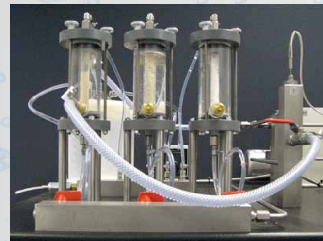
CE 380 Fixed Bed Catalysis