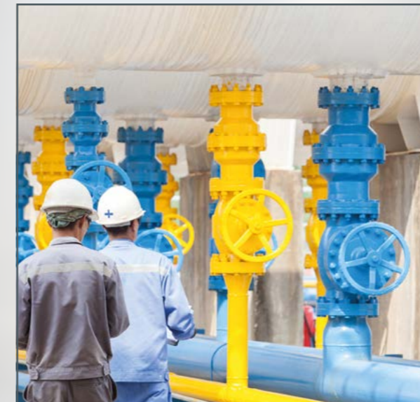
Valves and fittings of a large-scale distribution station

When selecting suitable valves and fittings, besides the specific requirements of the intended application, basic design questions must be taken into account in order to ensure a low-loss operation. For experiments in this field of process engineering, we recommend our RT 396 pumps, valves and fittings test stand.