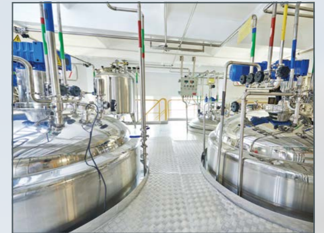
Large-scale stirred tanks

Efficient control systems are needed in order to meet all the requirements, alongside a possibility for heat recovery. What effects are possible, such as changes in the control parameters, can be studied using our RT 682 trainer.