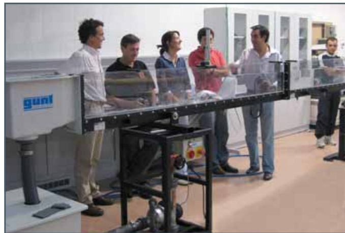
...in Spain with HM 160