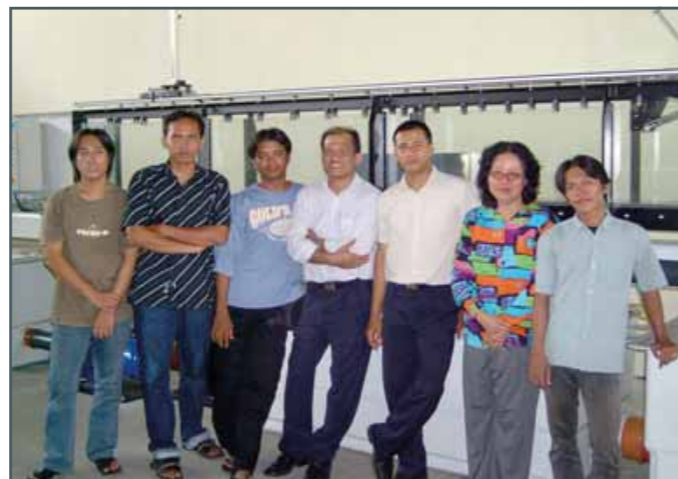
...in Indonesia with HM 162