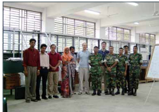
...in Bangladesh with HM 161