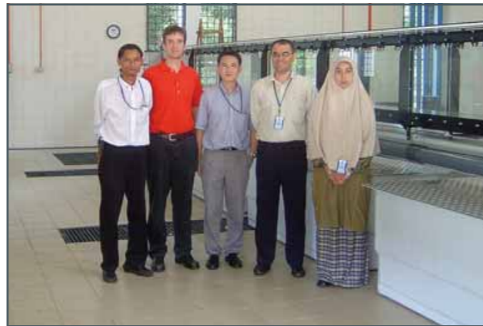
...in Malaysia with HM 162