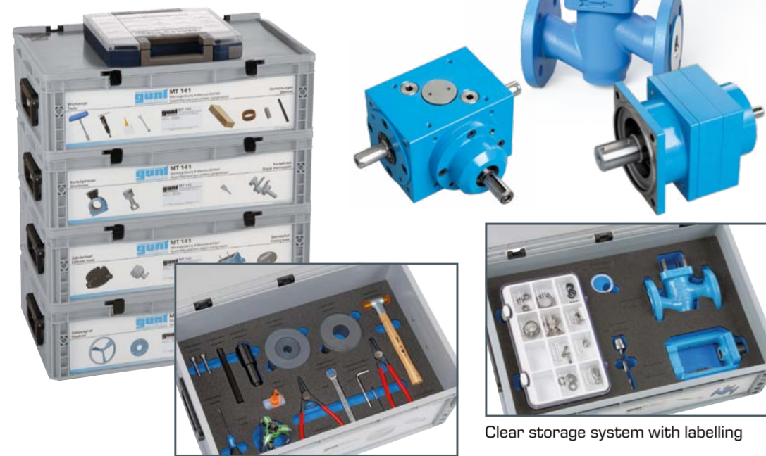
Complete set of assembly tools included