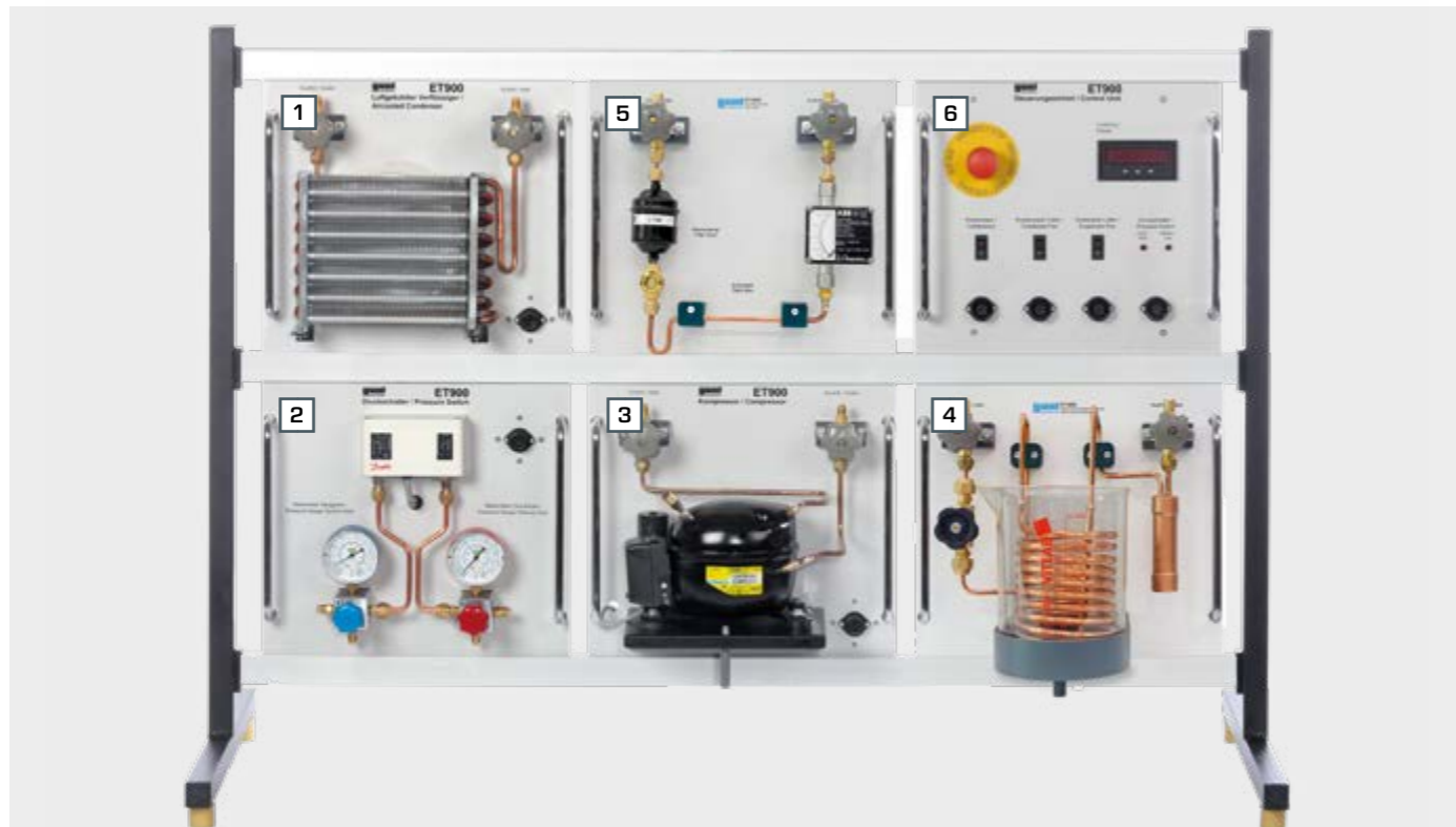
Refrigeration circuit with condenser and water cooling evaporator

Process schematic: 1 condenser, 2 pressure switch, 3 compressor, 4 air cooling evaporator, 5 sight glass with filter/dryer and flow meter, 6 display and control panel