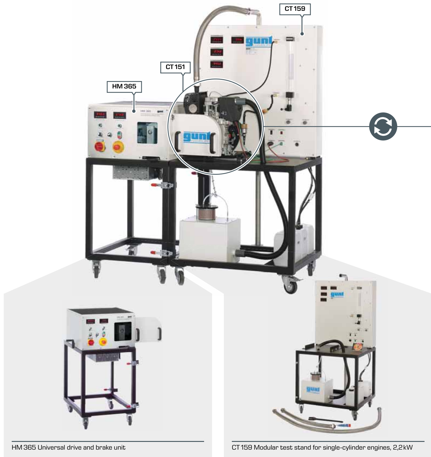
HM 365 Universal drive and brake unit

While the engines are running, HM 365 is operated in generator mode, thus braking the engines. The engines can be examined under full load or under partial load conditions. The characteristic diagram is determined with variable load and speed. The interaction of the brake and engine can also be examined in this context.