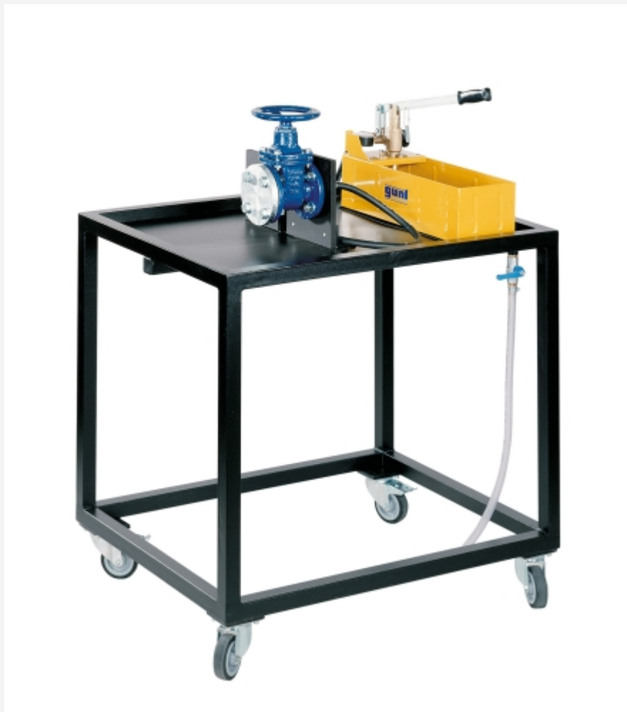
The illustration shows MT 162 together with the gate valve from MT 156.