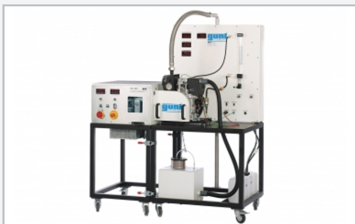
Complete experimental setup with HM 365, CT 159 and CT 151