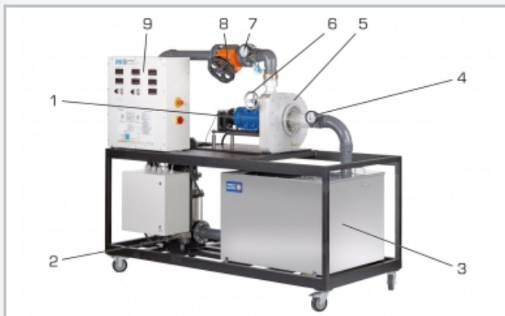
1 asynchronous machine, 2 pump, 3 tank, 4 pressure display at turbine outlet, 5 turbine, 6 adjustment of guide vanes, 7 pressure display at turbine inlet, 8 flow control valve, 9 switch cabinet with displays and controls