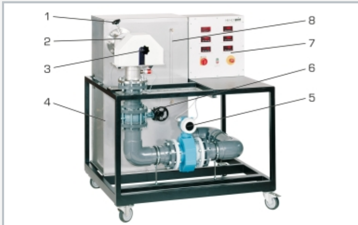
1 lever for adjusting the guide vanes, 2 Propeller type turbine, 3 brake, 4 tank with submersible pump, 5 flow rate sensor, 6 handwheel for throttle valve, 7 switch cabinet, 8 level indicator for tank