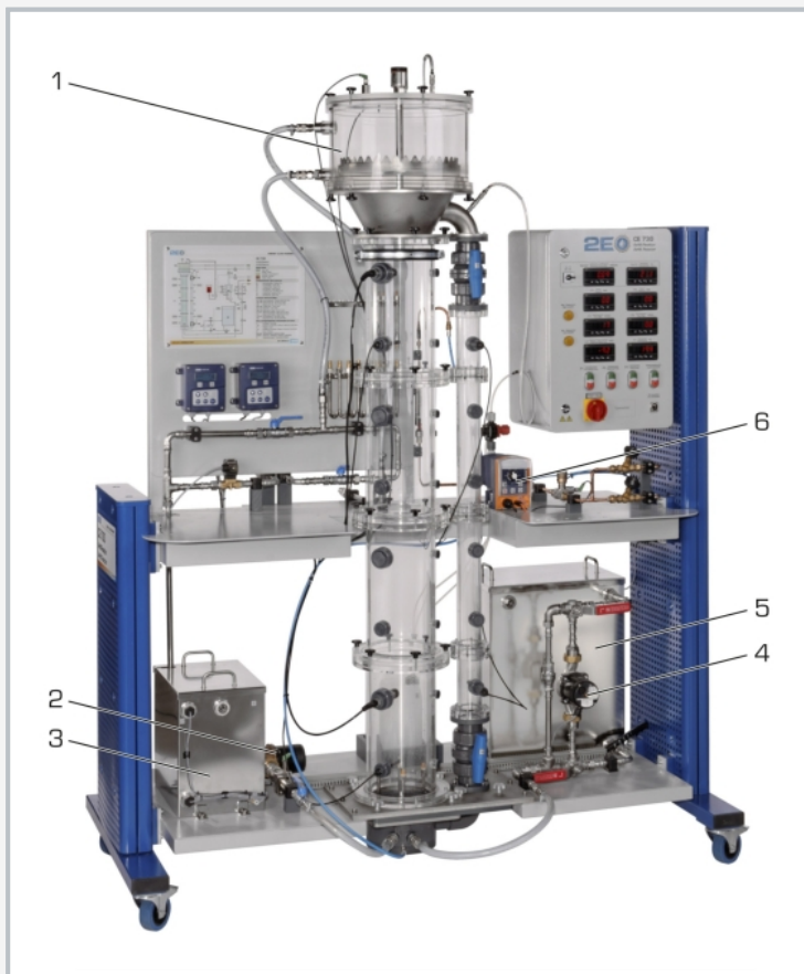
1 airlift reactor with external circulation, 2 feed pump, 3 feed tank, 4 circulating pump, 5 storage tank, 6 metering pump