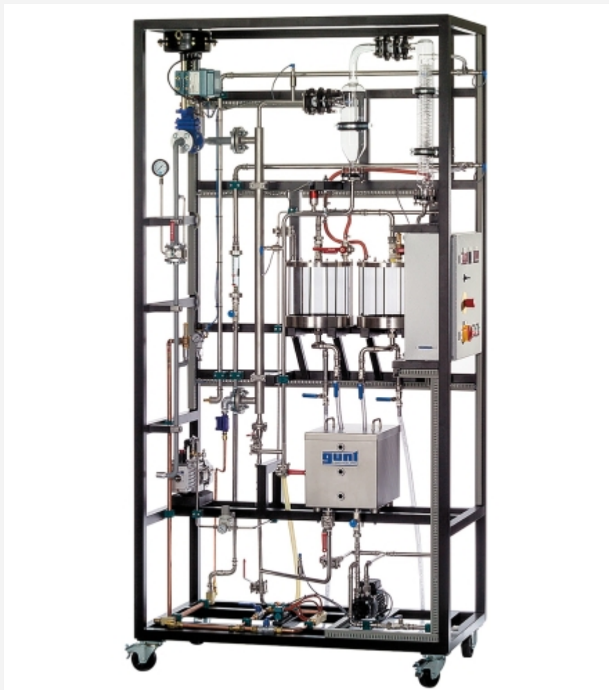
The illustration shows a similar unit