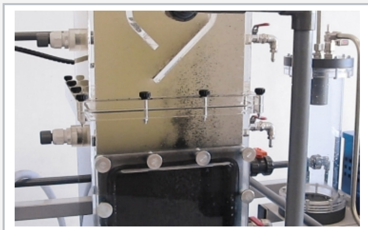
UASB reactor during experimental operation