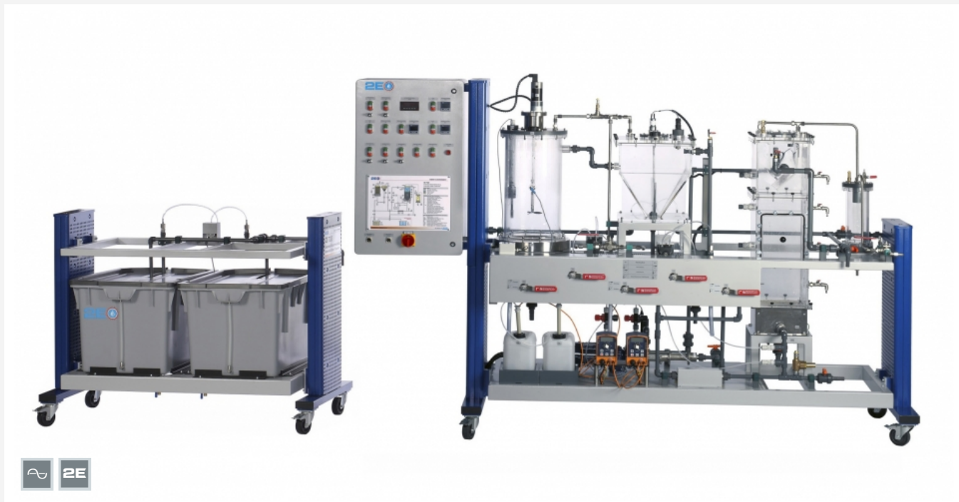
The illustration shows: supply unit (left) and trainer (right)