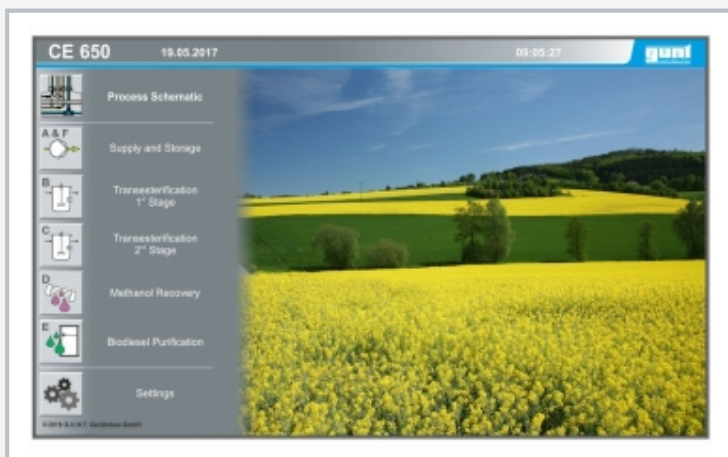
Start screen of the PLC for operation of the experimental plant