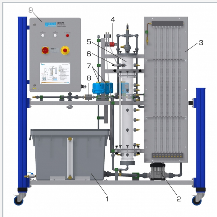
1 treated water tank, 2 backwash pump, 3 manometer panel, 4 differential pressure sensor, 5 filter, 6 system pressure sensor, 7 ball valve with motor, 8 flow rate sensor, 9 switch cabinet