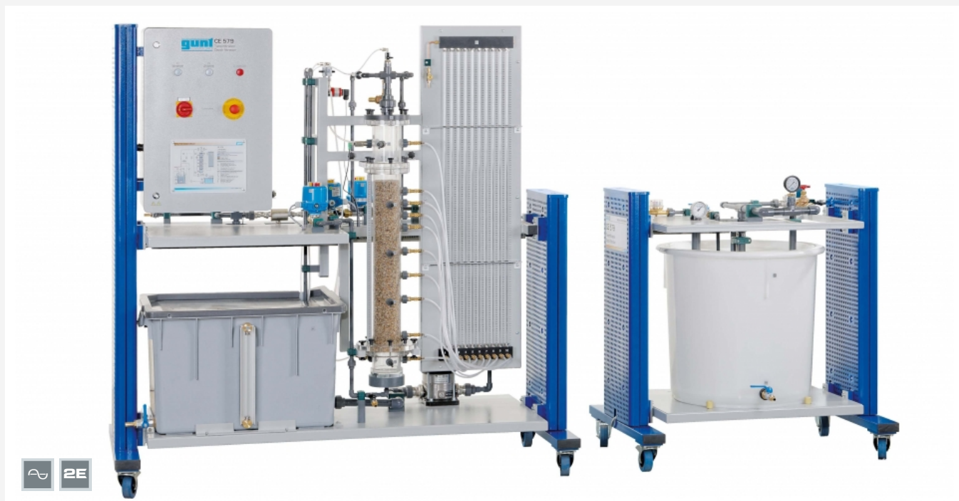
The illustration shows: trainer (left) and supply unit (right).