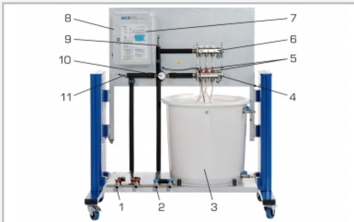
1 connection for feed, 2 connection for return, 3 tanks for hot and cold water, 4 feed distributor, 5 flow meter, 6 return distributor, 7 info panel, 8 connection box for sensors, 9 return temperature sensor, 10 flow meter, 11 return temperature sensor