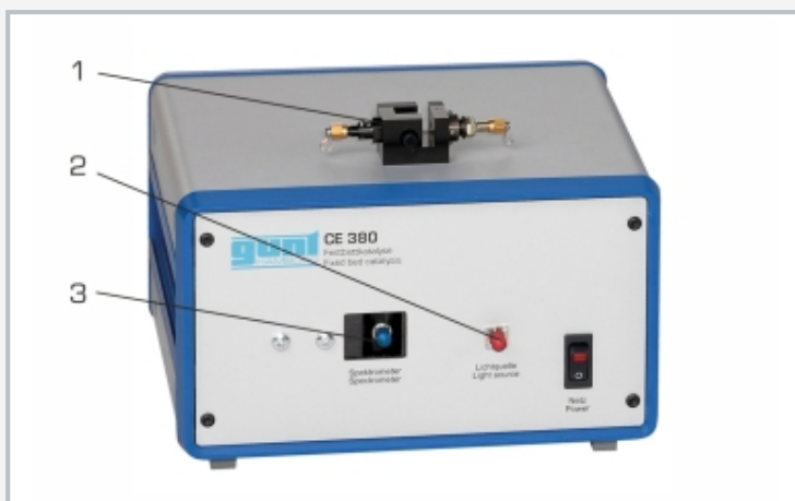
Photometer: 1 cuvette holder, 2 light source connection, 3 spectrometer connection