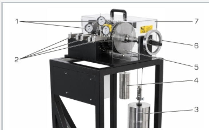
1 dial gauge, 2 bending beam, 3 set of weights, 4 set of weights for measuring transmission ratios, 5 planetary gear, 6 handwheel, 7 protective cover