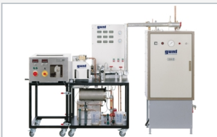
Experimental setup ready for operation: left: brake unit HM 365, centre: two-cylinder steam engine ET 813, right: steam generator ET 813.01