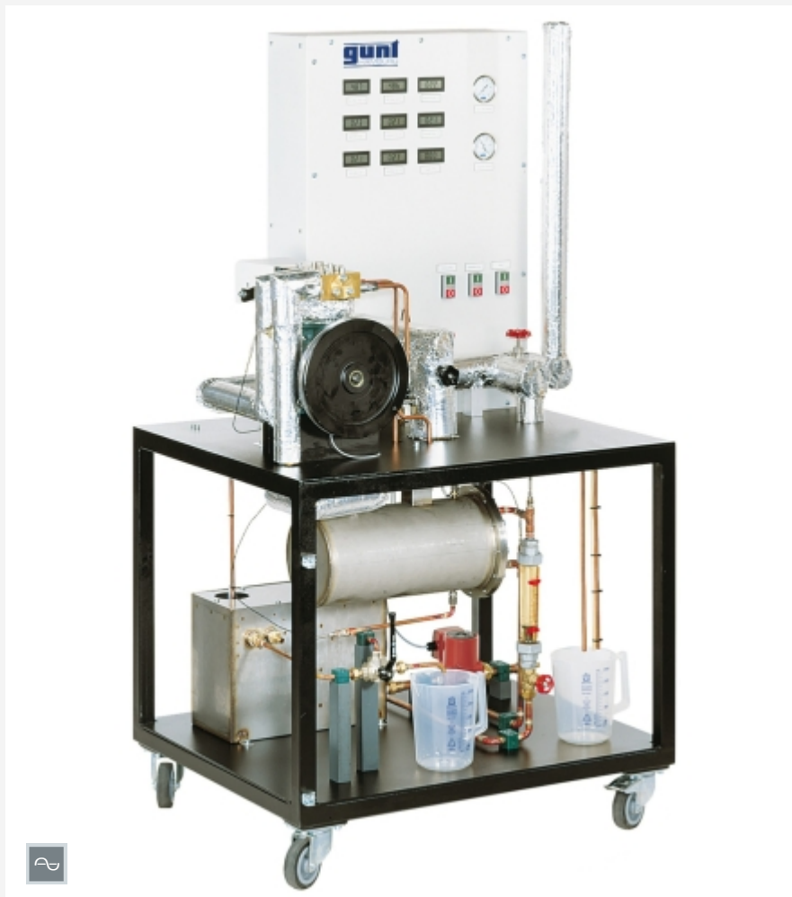
The illustration shows a similar unit