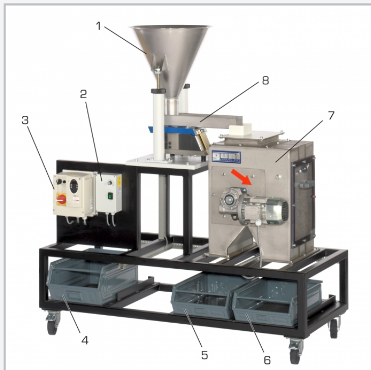
1 feed hopper with height adjuster, 2 vibrating trough controls, 3 magnetic separator controls, 4 solid compound tank, 5 magnetic materials tank, 6 non-magnetic materials tank, 7 magnetic separator, 8 vibrating trough