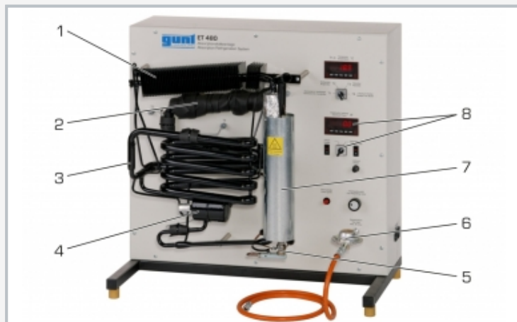
1 condenser, 2 evaporator with heater, 3 absorber, 4 tank, 5 gas burner, 6 pressure reducing valve for propane gas operation, 7 boiler with bubble pump to separate the ammonia, 8 displays and controls