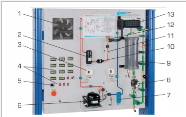
1 condenser with ventilator, 2 receiver, 3 high pressure switch, 4 displays and controls, 5 heater controller, 6 compressor, 7 liquid separator, 8 pump, 9 warm water tank with heater, 10 filter/drier, 11 sight glass, 12 expansion valve, 13 evaporator