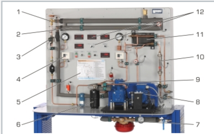
1 expansion valve, 2 evaporator, 3 refrigerant flow meter, 4 pressure switch, 5 process schematic, 6 receiver, 7 hot water circuit of the evaporator, 8 drive motor, 9 compressor, 10 cooling water flow meter, 11 condenser, 12 displays and controls