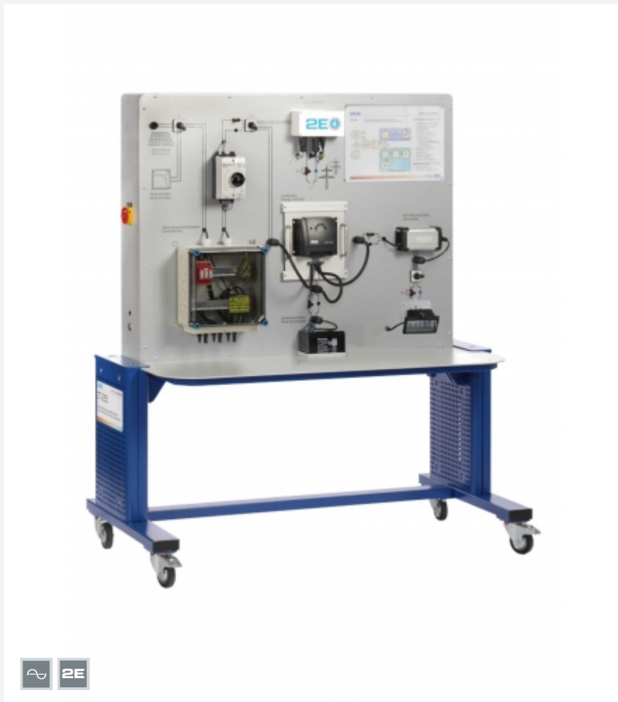
The illustration shows a similar unit