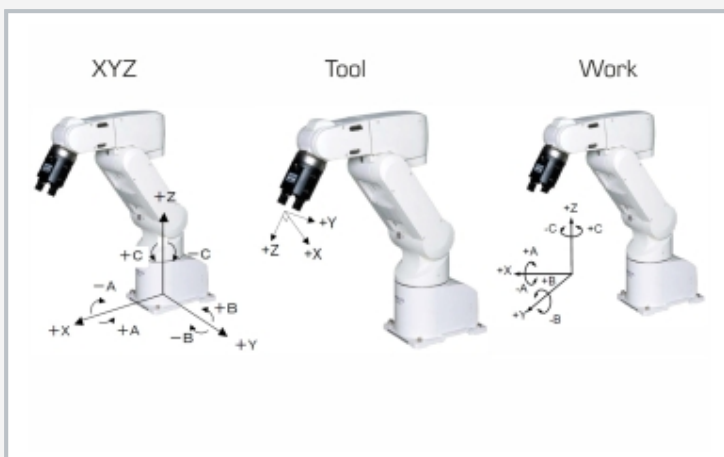
Jog modes XYZ: coordinate system of robot Tool: coordinate system of gripper Work: user-defined coordinate system