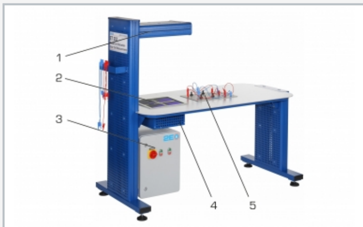
1 lighting unit, 2 four monocrystalline Si solar cells, 3 control unit, 4 Peltier module, 5 patch panel