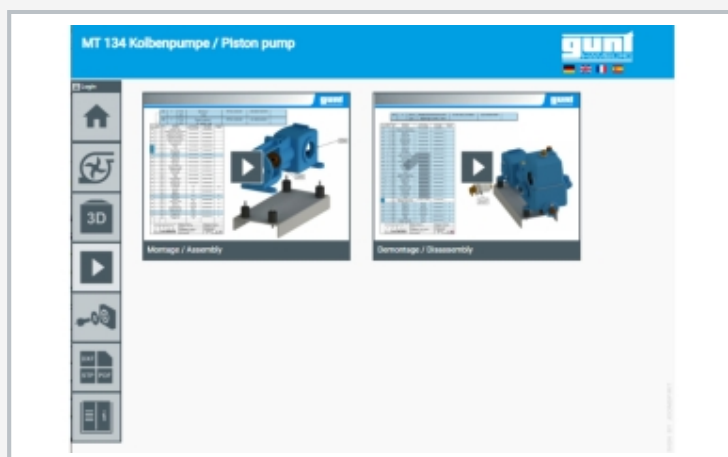
Screenshot of the GUNT Media Center