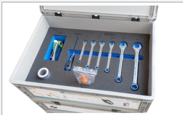
Storage system with foam inlay: tools