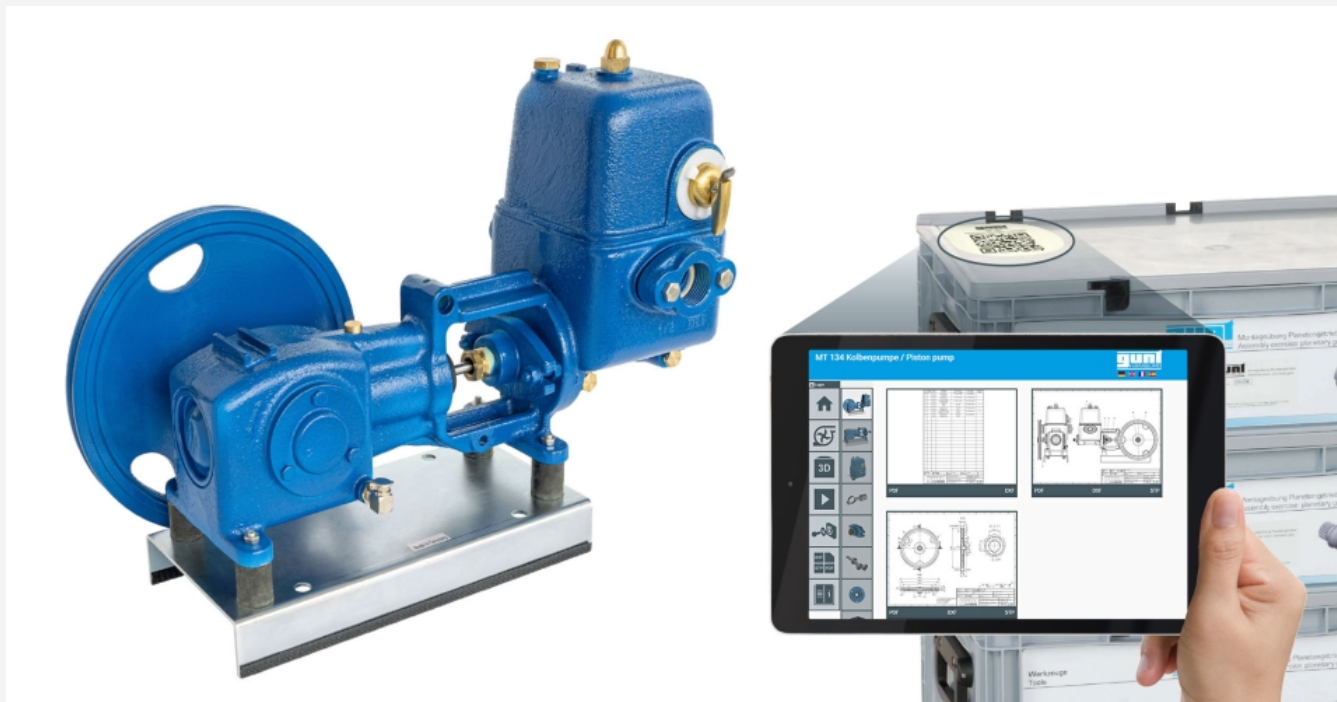
The illustration shows the device and the GUNT Media Center, tablet not included