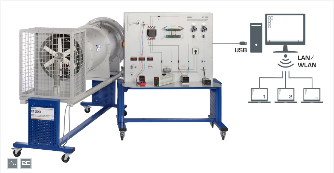
Network capable GUNT software for data acquisition: observation, acquisition, analysis of the experiments at any number of workstations via the customer's own LAN/WLAN network.