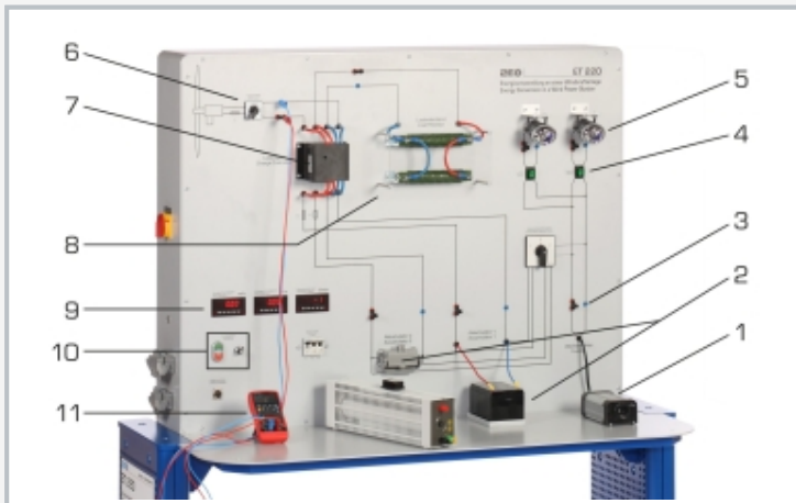
1 inverter, 2 accumulators, 3 current and voltage measuring point, 4 switch for electrical load, 5 bulbs as consumers, 6 wind power plant brake switch, 7 charge controller, 8 load resistances, 9 displays for wind velocities and speed, 10 control elements for axial fan, 11 multimeter