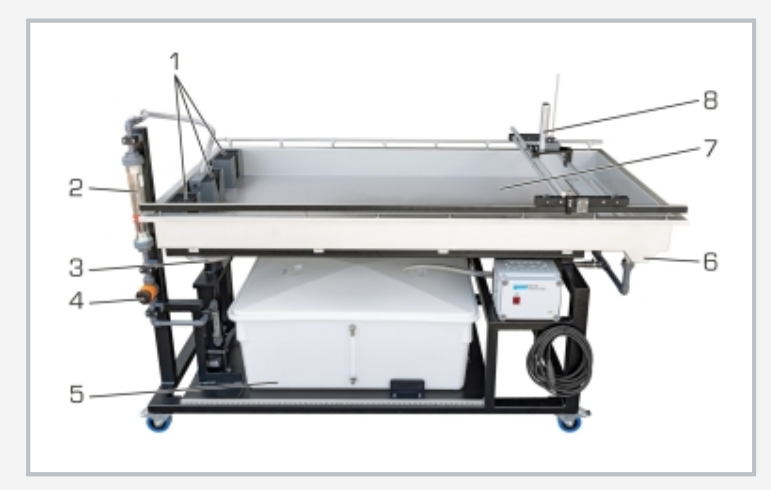
1 inlet elements, 2 flow meter, 3 inclination adjustment, 4 valve, 5 storage tank, 6 outlet element with filter, 7 experimental section, 8 point gauge