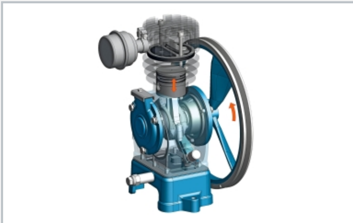
Transparent view of the assembled piston compressor (screenshot from assembly video)