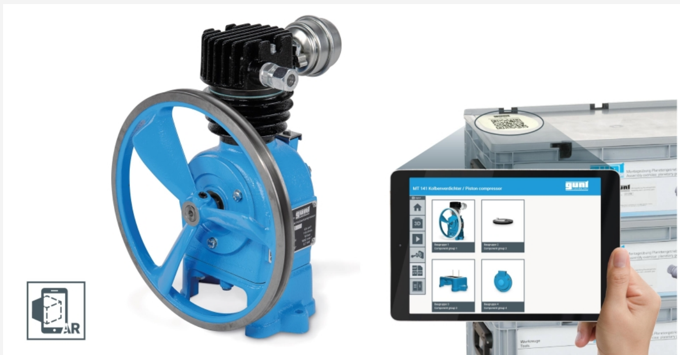
The illustration shows the assembled piston compressor and the GUNT Media Center on a tablet (not included)