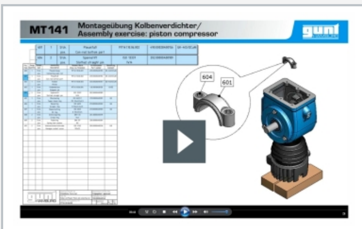
Multimedia teaching material: assembly video