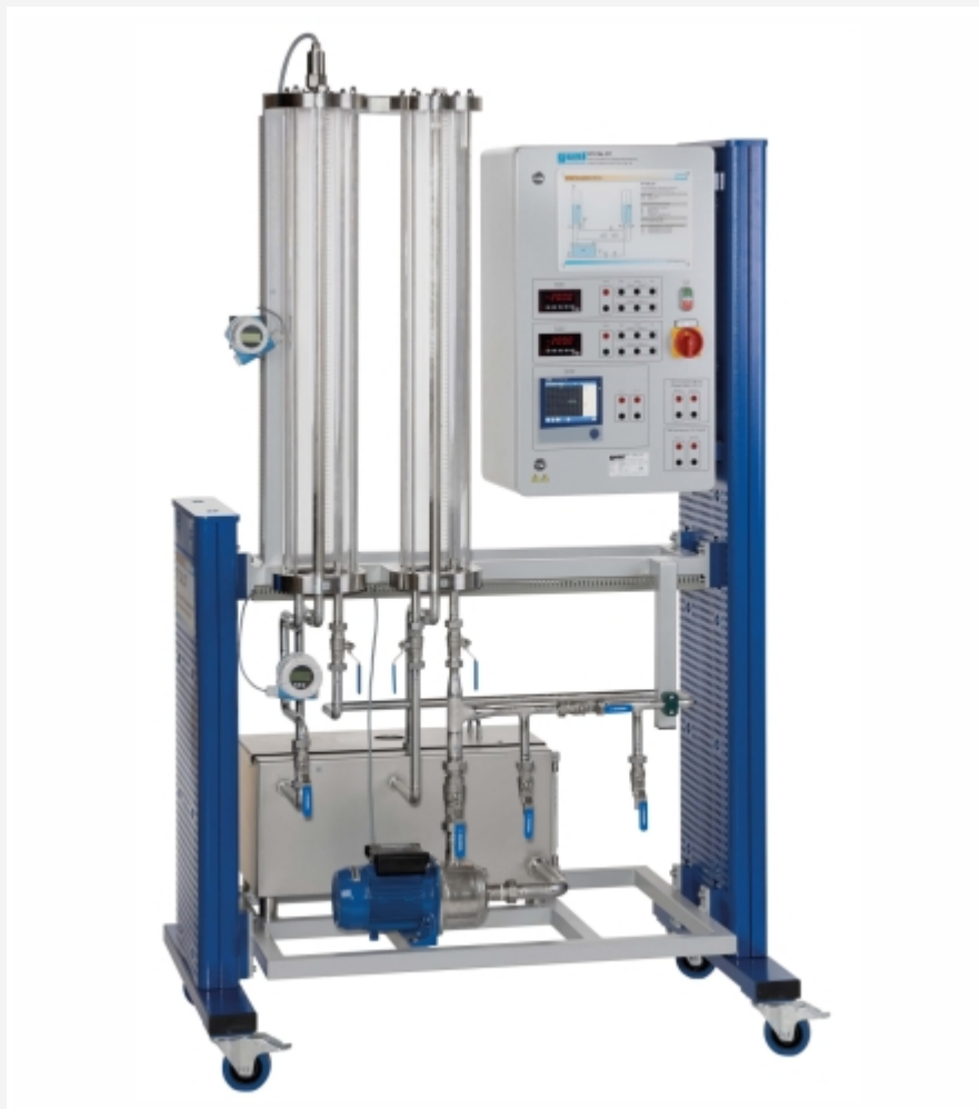
The illustration shows a similar unit