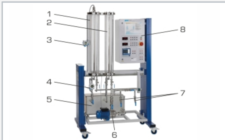
1 tank with two different sensors for level measurement, 2 tank with two free connections, 3 capacitive level sensor, 4 pressure sensor for level measurement, 5 storage tank, 6 pump, 7 external connection option, 8 switch cabinet with connection options