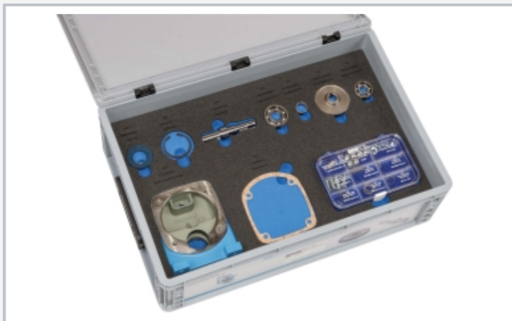
MT 120: storage system with foam inlay, all components have their place, the foam is labeled