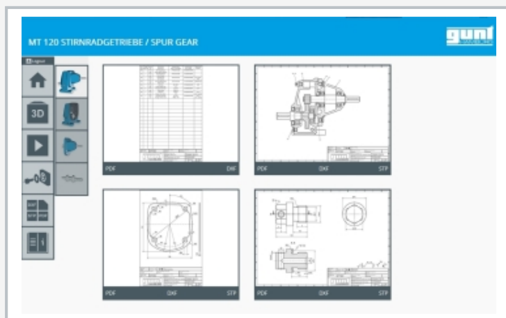
Screenshot of the GUNT Media Center