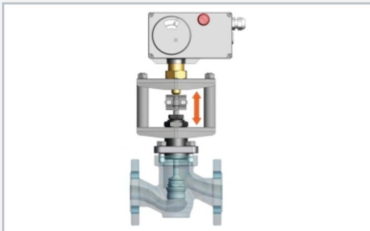
Transparent sectional view of the assembled control valve (screenshot from assembly video)