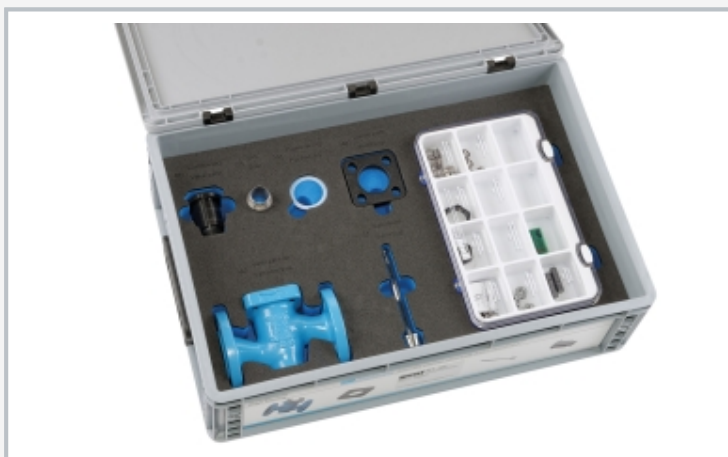
Storage system with foam inlay: all components have their place, the foam is labeled