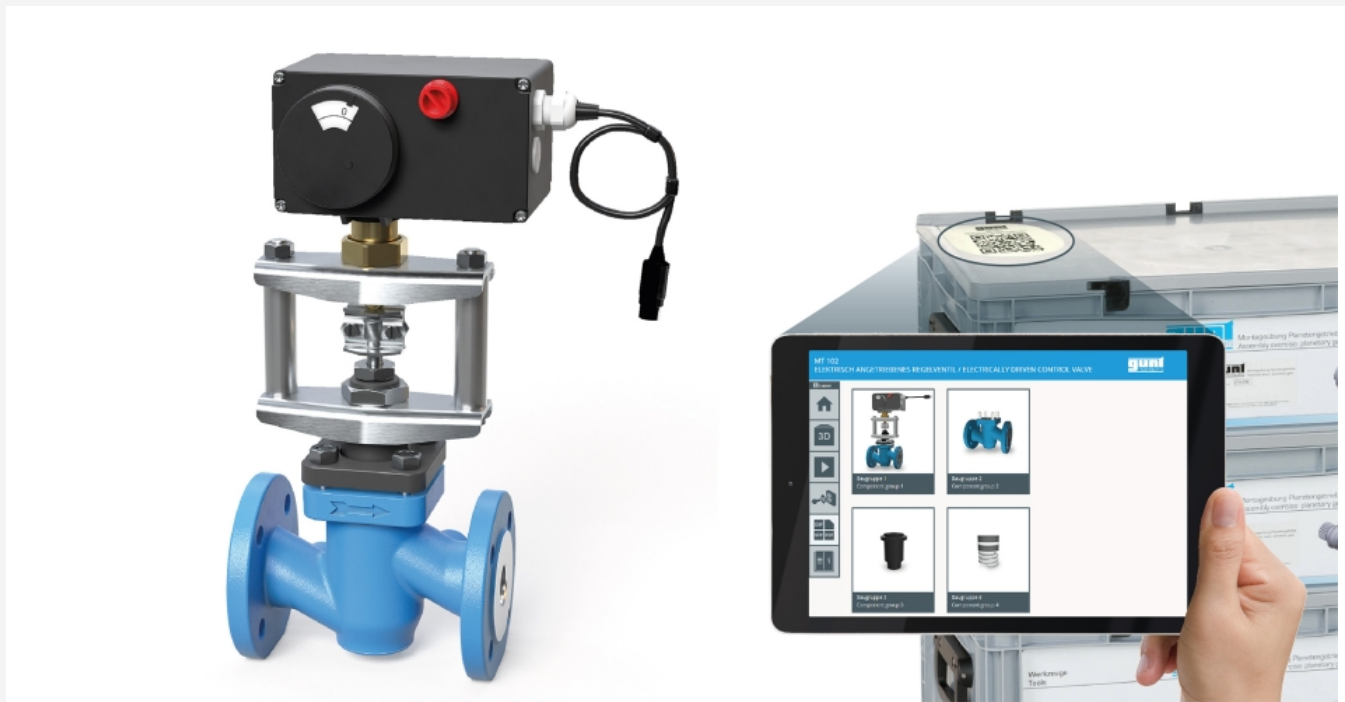
The illustration shows the assembled control valve and the GUNT Media Center on a tablet (not included)