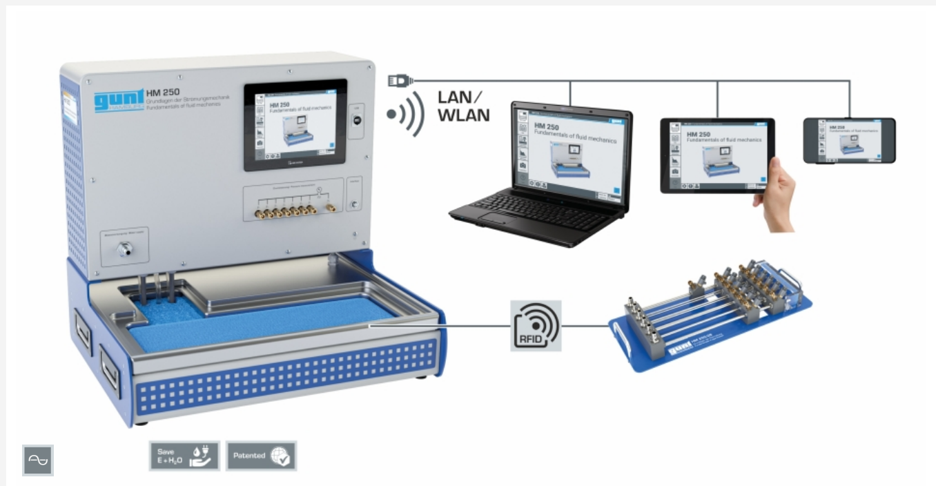
The illustration shows the HM 250 base module on the left and the HM 250.09 accessory on the right, screen mirroring is possible on up to 10 end devices