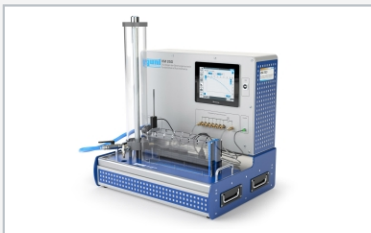
The illustration shows the HM 250.06 accessory on the worktop of the HM 250 base module