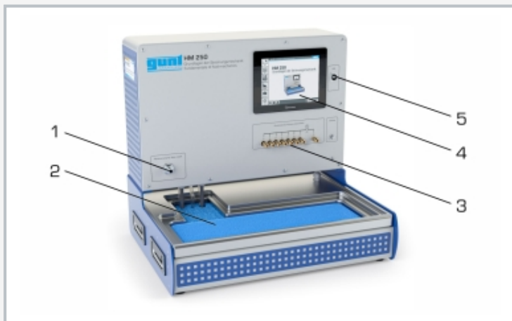
1 water connection for accessories, 2 storage tank with foam inlay, 3 connections for pressure measurement, 4 touch screen, 5 USB port