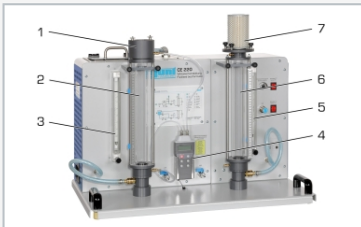
1 water overflow, 2 tank for water, 3 rotameter for water, 4 hand-held measuring unit, pressure loss, 5 rotameter for air, 6 tank for air, 7 filter