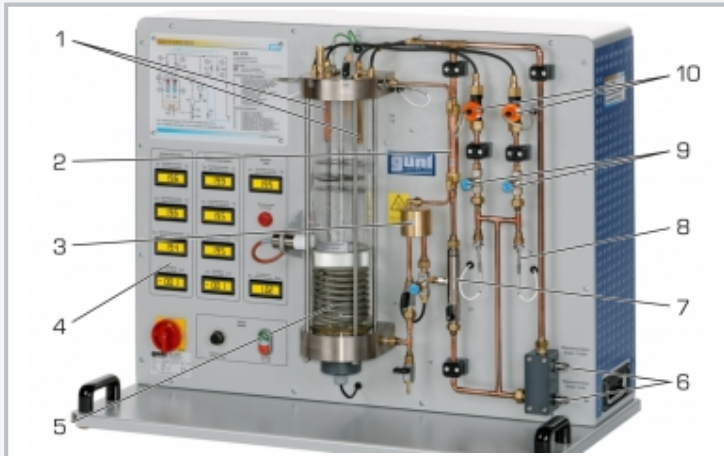
1 condensers, 2 heat exchanger, 3 steam trap, 4 displays for temperature, flow rate and pressure, 5 heater, 6 cooling water connections, 7 water jet pump, 8 temperature sensor, 9 valve for adjusting the cooling water, 10 cooling water flow rate sensor