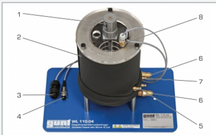
1 stirring machine, 2 stirred tank, 3 stirring machine connection, 4 temperature sensor connection, 5 jacket water connection, 6 water outlet and inlet in stirred tank, 7 coiled tube water connection, 8 temperature sensor