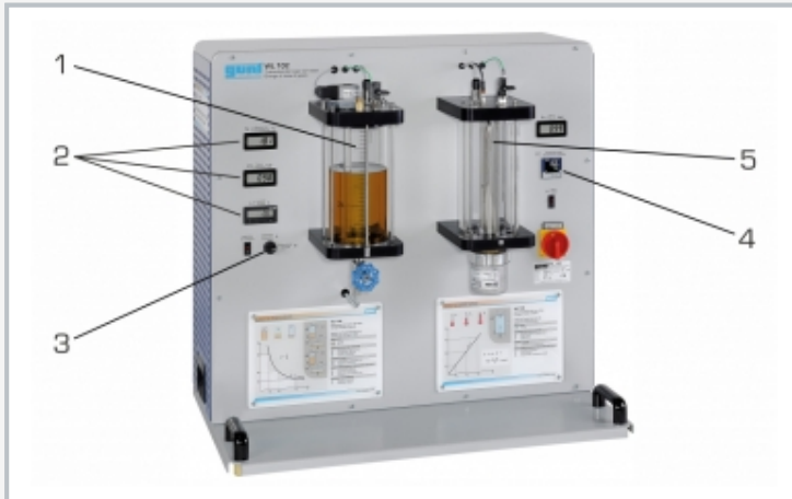
1 tank 1 for isothermic change of state, 2 digital displays, 3 switching between compression and expansion with 5/2-way valve, 4 heating controller, 5 tank 2 for isochoric change of state