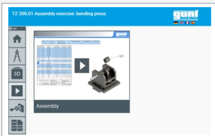
Screenshot of the GUNT Media Center: assembly video