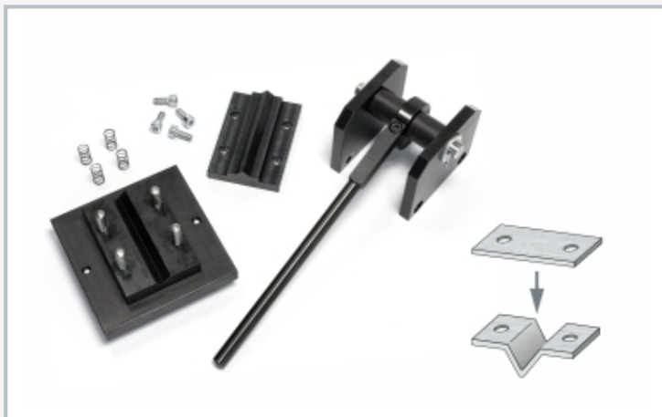
Bending press disassembled into functional groups: upper punch (stroke), support frame, lever, on the right the product of the bending press