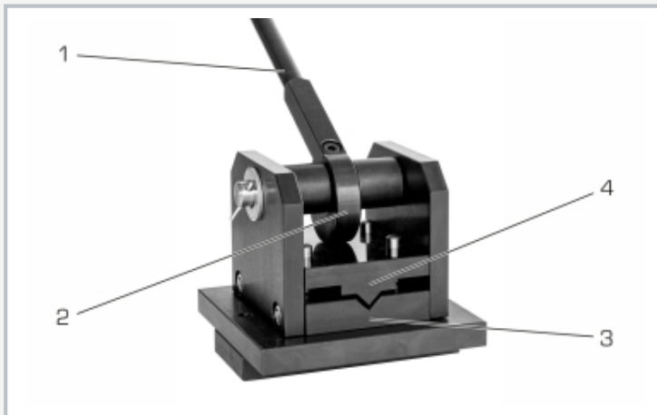
1 lever, 2 eccentric, 3 lower punch, 4 upper punch