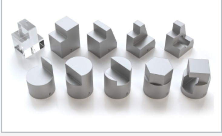
Prismatic and cylindrical models