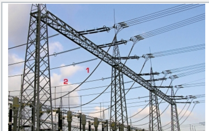
Free-hanging cables in practice (portal): 1 stay cable, 2 power line, similar to overhead line