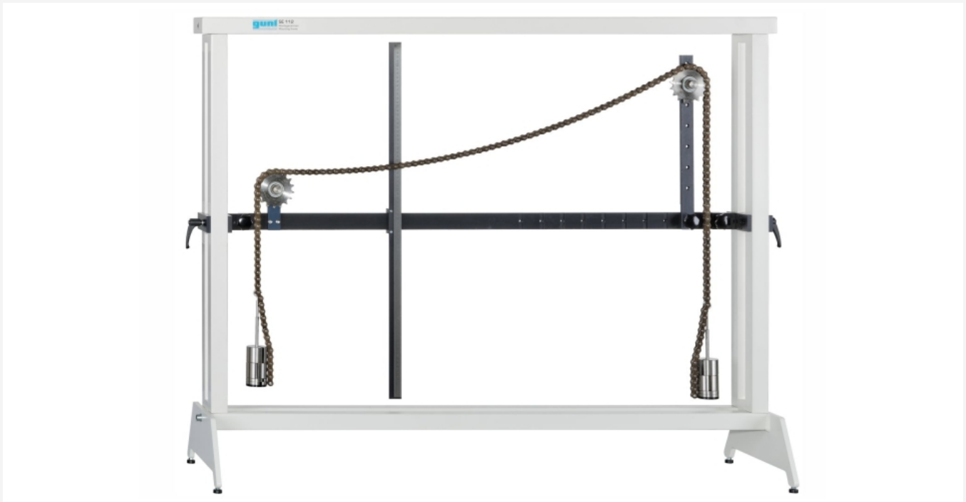
The illustration shows SE 110.50 in the frame SE 112