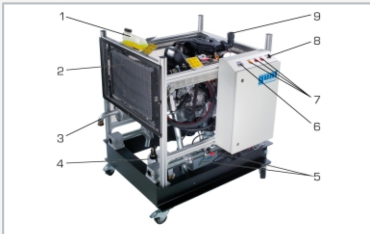
1 cooling water tank, 2 cooler with protective screen, 3 exhaust gas connection, 4 fuel tank, 5 battery with main switch, 6 operating time counter, 7 warning lamps, 8 key switch for ignition, 9 connection for engine feed air