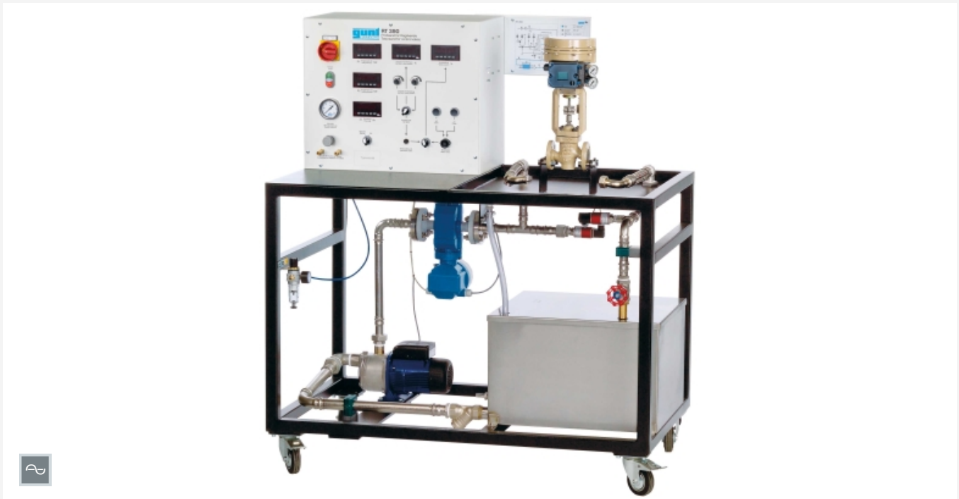
The illustration shows a similar unit with accessory RT 390.01.