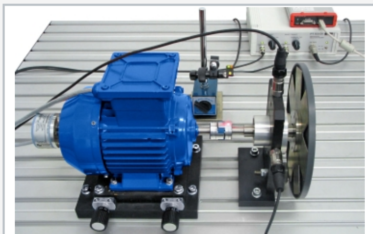
The illustration shows PT 500.18 together with PT 500 and PT 500.04