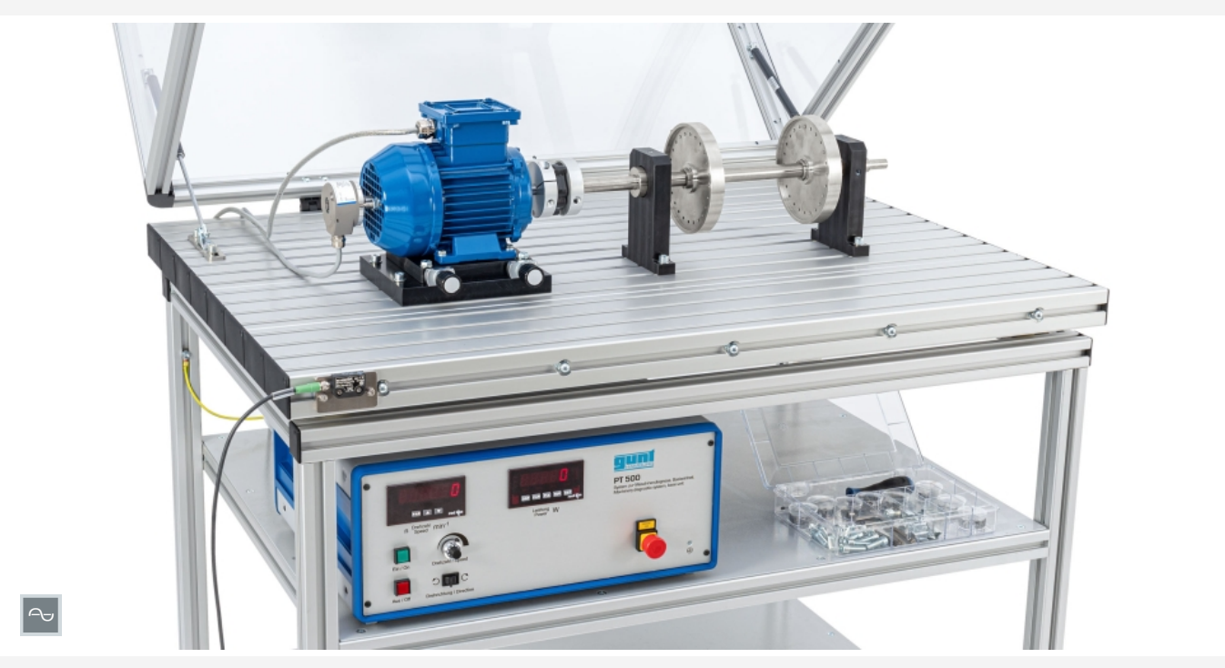
The illustration shows PT 500 together with the trolley PT 500.01