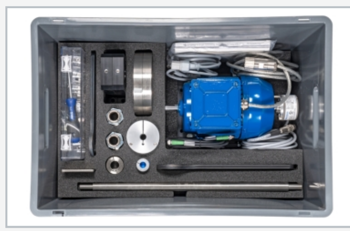
The illustration shows the components in the storage system