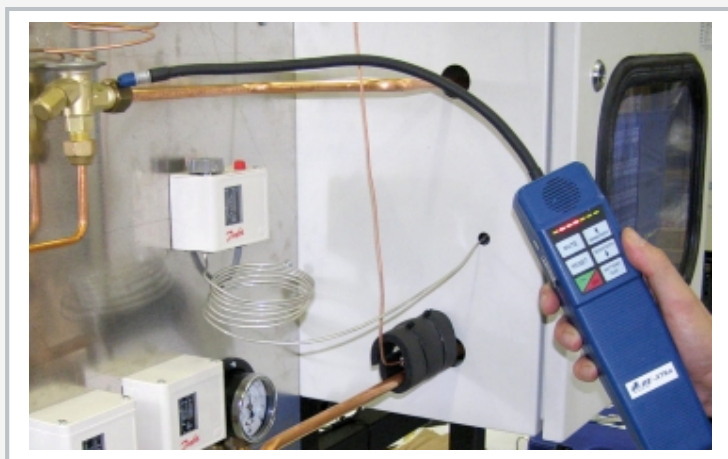
Leak test at the expansion valve of the fully assembled system