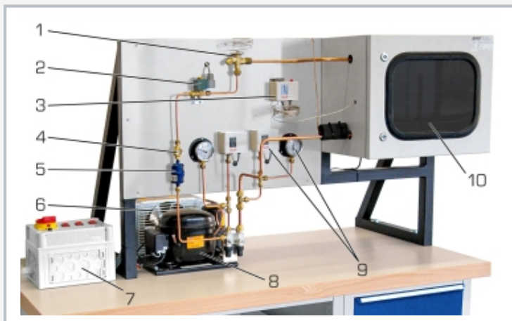
1 expansion valve, 2 solenoid valve, 3 thermostat, 4 sight glass, 5 filter/drier, 6 condenser with fan, 7 switch cabinet, 8 compressor, 9 pressure switch with manometer, 10 refrigeration chamber with sight window and integrated evaporator