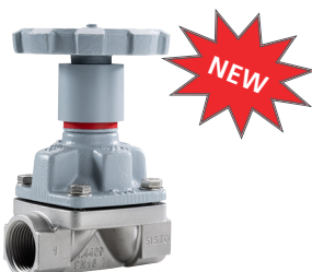
SISTO-16/ -20 with thread ends