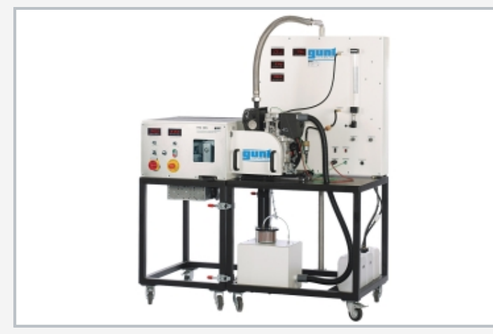
Complete experimental setup with HM 365, CT 159 and CT 151

1 air filter, 2 orifice plate, 3 stabilisation tank, 4 fuel tank with pump, 5 fuel filter, 6 measuring tube for fuel consumption, 7 diesel return, 8 motor (CT 150-CT 153), 9 HM 365; B fuel consumption, T temperature, F volumetric flow rate, n speed, M torque, orange: fuel, green: intake air, yellow: exhaust gas