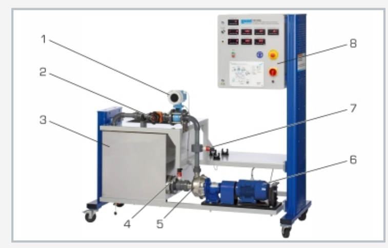
1 electromagnetic flow meter, 2 flow control valve, 3 storage tank, 4 ressure sensor at pump inlet, 5 centrifugal pump, 6 drive motor including measurement of torque, 7 pressure sensor at pump outlet, 8 switch cabinet with displays and controls