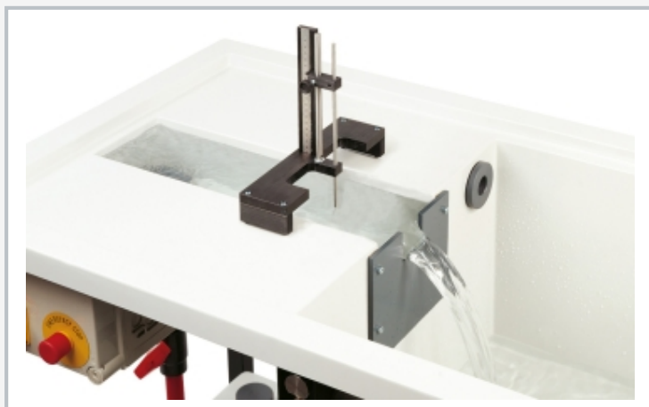
Base module for experiments in fluid mechanics with plate weir HM 150.03